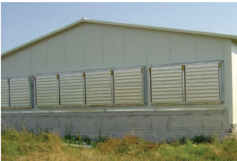
Euroemme® EM50 exhaust fans with shutters closed at AMVROSIADIS farm.