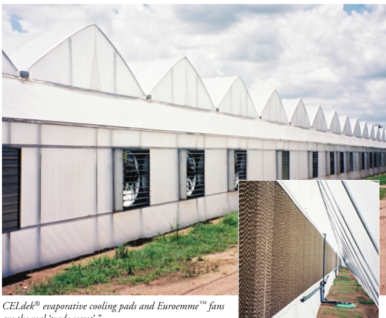
CELdek ® evaporative cooling pads and Euroemme ™ fans are the real 'trade secret'.

The average market price in summer for first-grade tomatoes is ZAR 2.50/kg. In winter, however, prices rise to ZAR 4.00/kg owing to a natural shortage, because the ambient climate in South Africa in winter makes it difficult to successfully grow tomatoes using conventional methods.