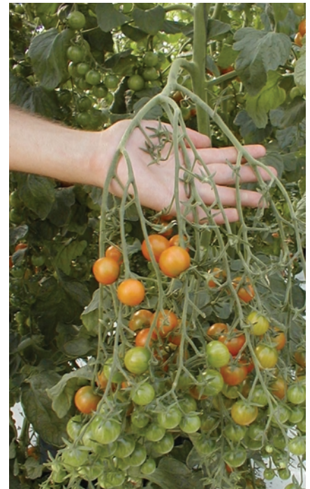
Eight fruit-bearing shoots from a single branch is a result of controlled climate with CELdek system.

Providing an optimal climate inside when conditions outside are far from ideal is not easy. Whether in tropical or sub-tropical regions or in severe temperate zones, the production rate of, and